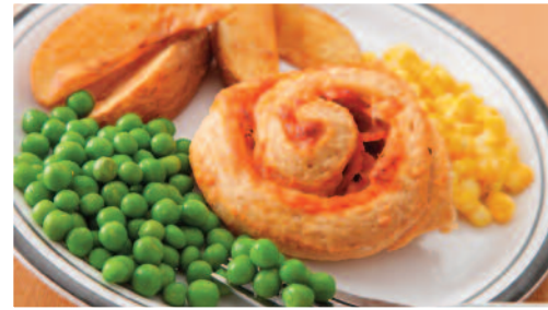
Cheese and Ham/Vegetarian Pinwheel with Potato Wedges and Seasonal Vegetables