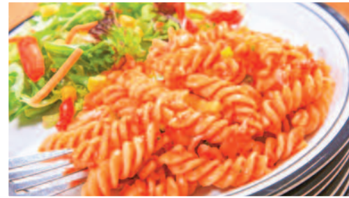
Bacon and Cheese/ Vegetarian Pasta Bake with Crusty Bread and Seasonal Vegetables