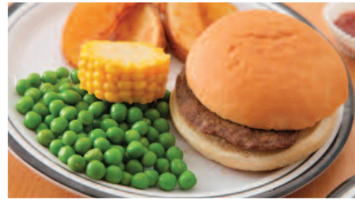
Beef/Veggie Burger in a Bun with Potato Wedges and Baked Beans or Seasonal Vegetables