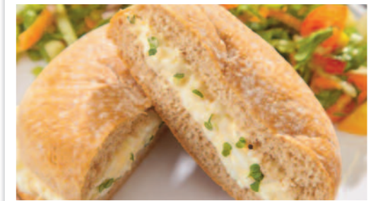
Deli Option Choice of Breads and a Selection of Fillings Served with Salad