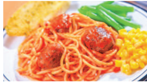
Beef/Veggie Meatballs and Spaghetti in Herb and Tomato Sauce with Garlic Bread and Seasonal Vegetables