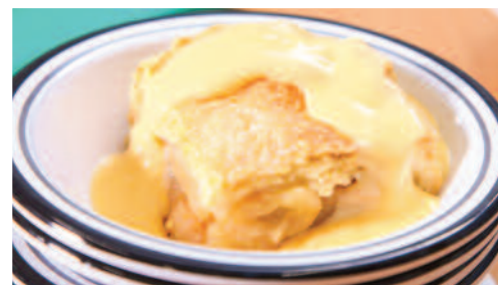
Apple Pie and Custard