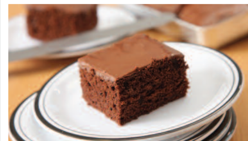
Iced Chocolate Sponge Cake