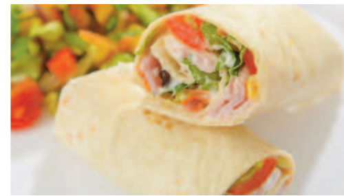
Deli Option Choice of Breads and a Selection of Fillings Served with Salad