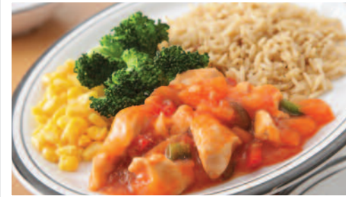
Sweet and Sour Chicken/Quorn with Rice and Seasonal Vegetables