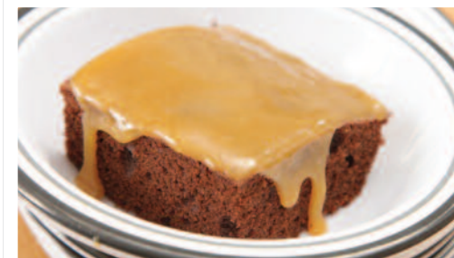
Sticky Toffee Pudding and Custard