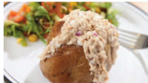
Filled Jacket Potato with a Selection of Fillings Served with Salad