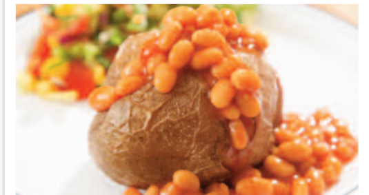
Filled Jacket Potato with a Selection of Fillings Served with Salad