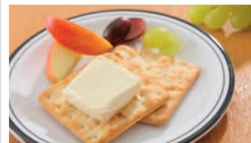
Fruit, Cheese & Crackers and Yoghurt