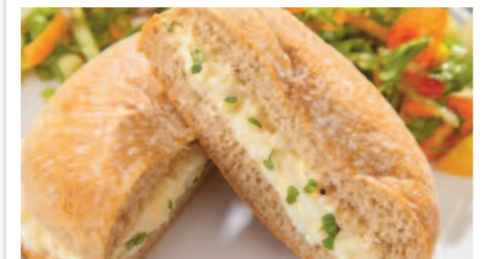
Deli Option Choice of Breads and a Selection of Fillings Served with Salad