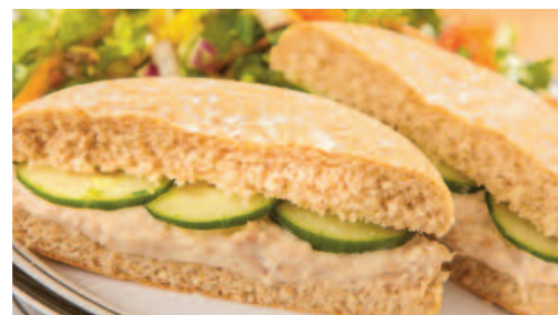
Deli Option Choice of Breads and a Selection of Fillings Served with Salad