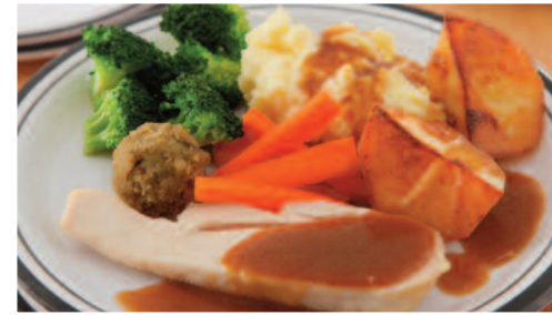
Roast of the Day/Quorn Fillet with Roast/Mashed Potatoes, Seasonal Vegetables and Gravy