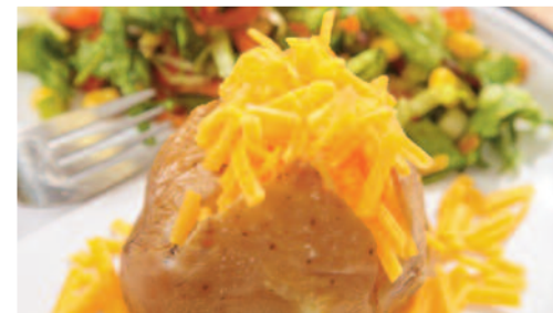
Filled Jacket Potato with a Selection of Fillings Served with Salad