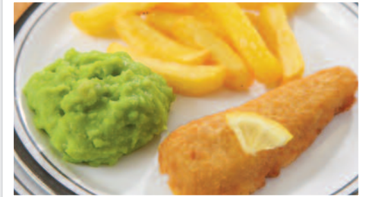
MSC Fish, Chips and Garden Peas/Mushy Peas or Baked Beans