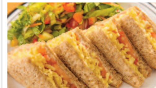
Deli Option Choice of Breads and a Selection of Fillings Served with Salad