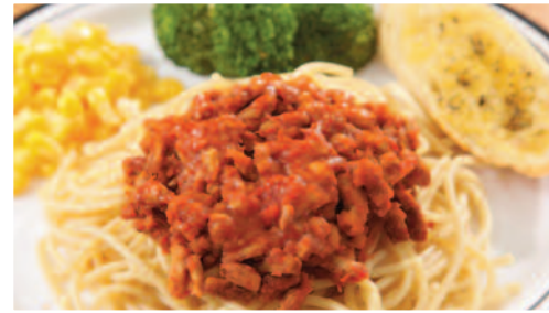
Spaghetti Bolognese/Vegetarian Bolognese with Garlic Bread and Seasonal Vegetables