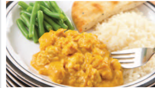
Chicken/Vegetarian Curry with Rice, Naan Bread with Seasonal Vegetables