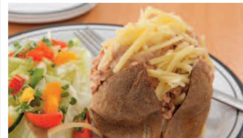
Filled Jacket Potato with a Selection of Fillings Served with Salad