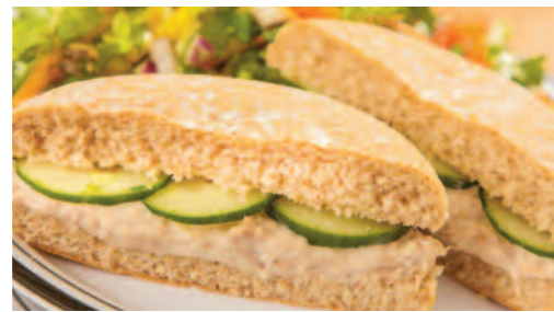
Deli Option Choice of Breads and a Selection of Fillings Served with Salad