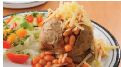
Filled Jacket Potato with a Selection of Fillings Served with Salad