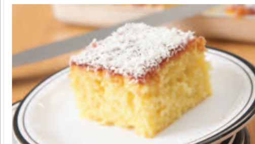
Jam and Coconut Sponge