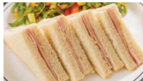
Deli Option Choice of Breads and a Selection of Fillings Served with Salad