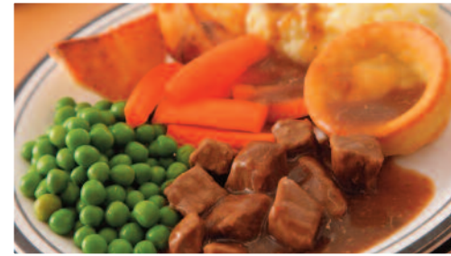
Braised Beef/Quorn Fillet with Yorkshire Pudding Roast/Mashed Potatoes Seasonal Vegetables and Gravy