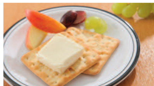
Fruit, Cheese & Crackers and Yoghurt