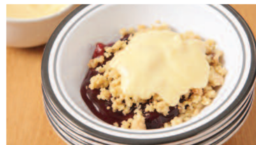
Fruit Crumble and Custard