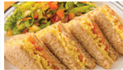
Deli Option Choice of Breads and a Selection of Fillings Served with Salad