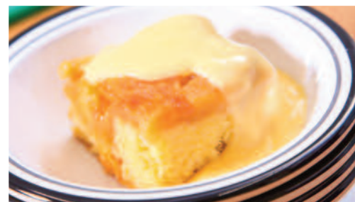
Apple Sponge and Custard