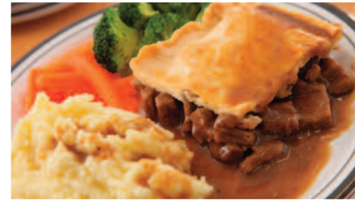
Homemade Steak/Vegetarian Pie with Mashed Potatoes, Seasonal Vegetables and Gravy